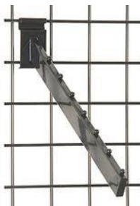
7-BALL WATERFALL HOOK