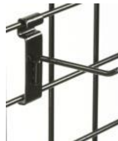
GRID WALL HOOK