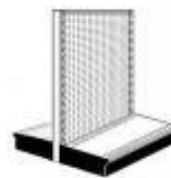
Dimensions: 4' wide x 6' high x 32" base

Please indicate below where you would like your gondola(s) set up in your booth: