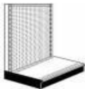
Dimensions: 4' wide x 6' high x 16" base